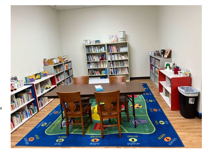
along with our Education Outreach friends,